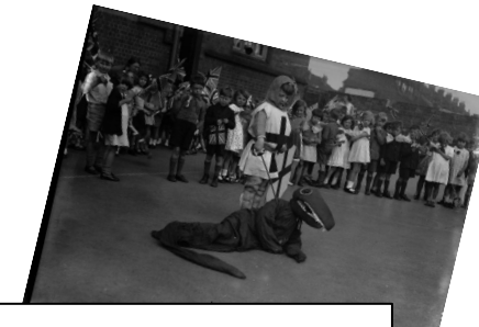
Empire Day - 1938